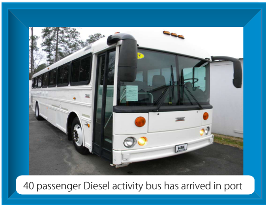
40 passenger Diesel activity bus has arrived in port

The second week of July, Gus and Illiana Hernandez, the current executive directors of the Highlands Camp introduced us formally to the staff. We had met many of them last year at our 180° youth camp (July 2014 prayer letter). The whole day went well and after some follow up meetings we headed into Andres (the city we want to start the new church) to enroll the girls in a local school called "Las Palomitas" (Popcorn). Later that same day,