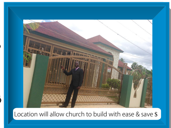
Location will allow church to build with ease & save $