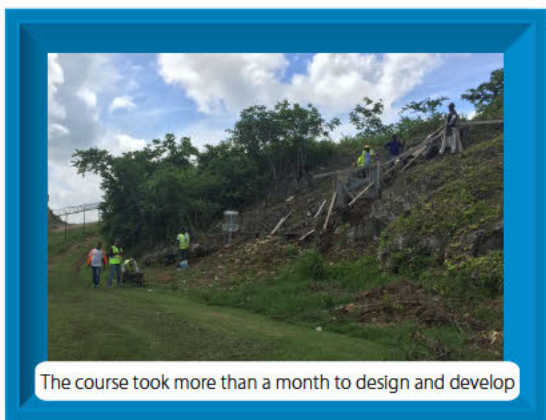
The course took more than a month to design and develop

It is finally here! I have been working on this since the beginning of April and the fruits are just now beginning to show. The Dominican Republic now has its first disc golf course! I have had so much fun working with Dynamic Discs and their wonderful staff to obtain the equipment necessary to build this beautiful 9-hole course. The Foundation bought the equipment mid April and by the time I flew down in May the equipment was there.