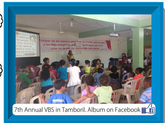
7th Annual VBS in Tamboril. Album on Facebook