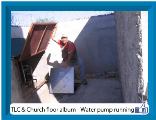
TLC & Church floor album - Water pump running