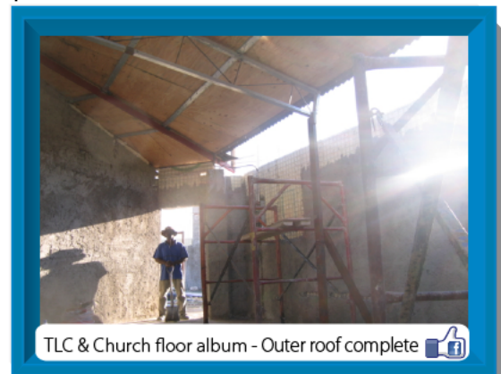
TLC & Church floor album - Outer roof complete