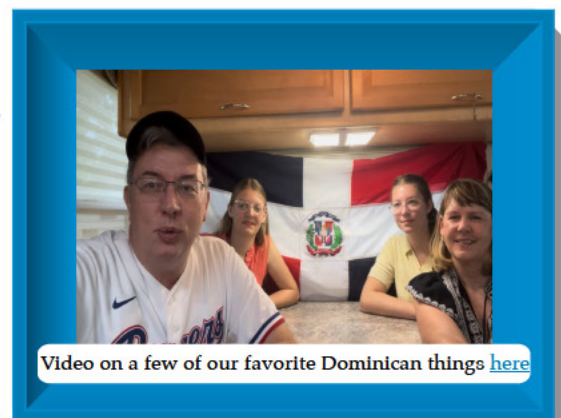
Video on a few of our favorite Dominican things here

1. The Dominican Republic is the only country in the world to have an image of the Bible on its national flag. 2. The D.R. is the second-largest island in the Caribbean after Cuba but since it shares the island of Hispaniola with Haiti, that makes us the largest populated island in the Caribbean. 3. Spanish is the official language of the D.R. but you will hear Haitian Creole spoken in every city on the island as well. The Peso is our official currency and is currently $1 to 59 Pesos. Click here for full article.