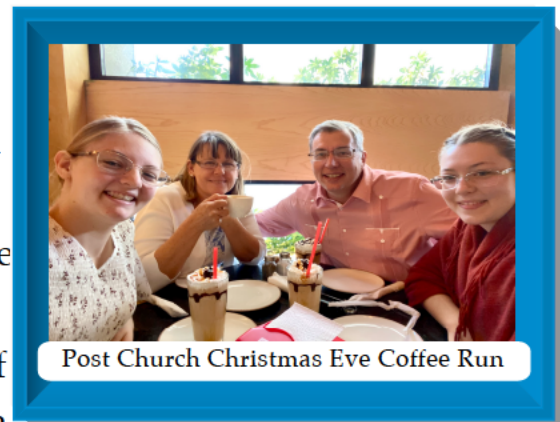
Post Church Christmas Eve Coffee Run

Christmas Happenings! We began Christmas on Wednesday by taking a break from building the church and went and visited the Pastors, wives, full time workers and their kids. We gave each one a present to not only show our love and appreciation but to fill this season with anticipation, love, and joy as we celebrate the birth of Jesus Christ, the most precious gift ever given to man.