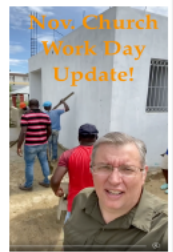
Nov. Church Work Day Update!

Christmas Happenings! We began Christmas on Wednesday by taking a break from building the church and went and visited the Pastors, wives, full time workers and their kids. We gave each one a present to not only show our love and appreciation but to fill this season with anticipation, love, and joy as we celebrate the birth of Jesus Christ, the most precious gift ever given to man.