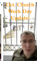
Oct. Church Work Day Update!