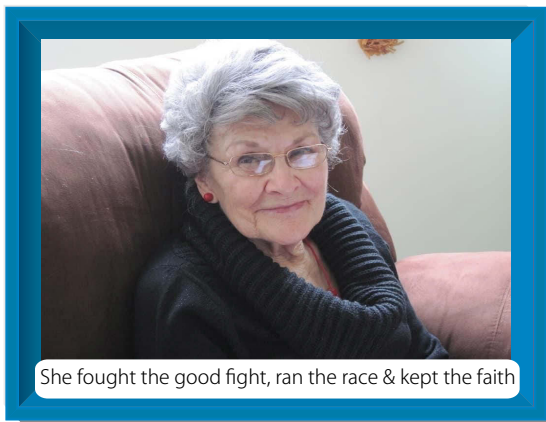
She fought the good fight, ran the race & kept the faith