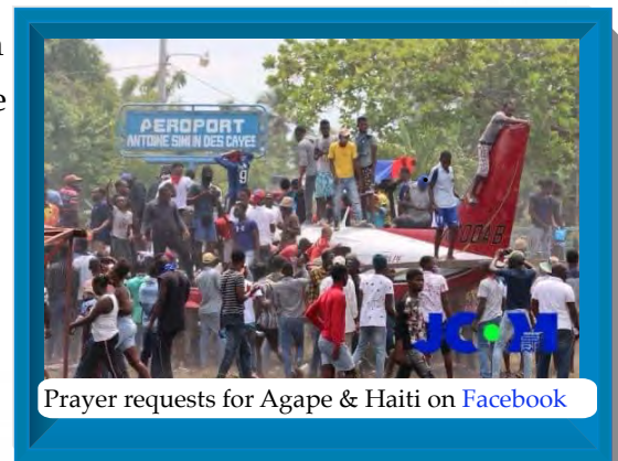
Prayer requests for Agape & Haiti on Facebook