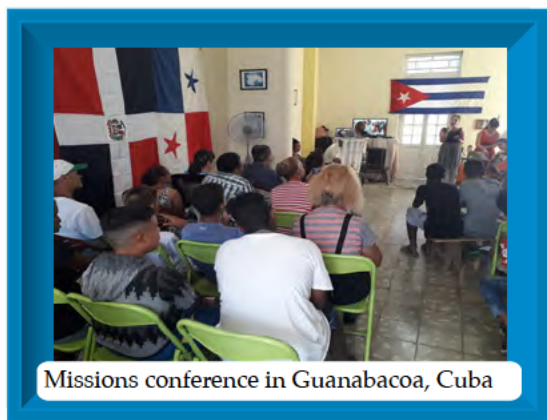
Missions conference in Guanabacoa, Cuba