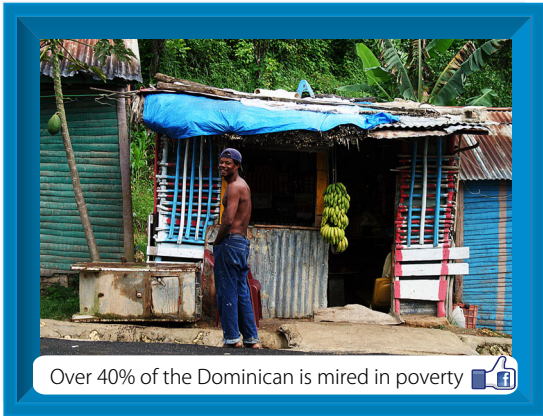
Over 40% of the Dominican is mired in poverty

The solution for poverty is not more charity, which quickly leads to more dependency. If we are serious about trying to solve poverty in a certain area then we should not try to "alleviate" it either. The word, alleviate, means to make easier or to endure. Basically this kicks the can down the road, it might make you feel better but it does not have any long-term impact that passes to the next generation.